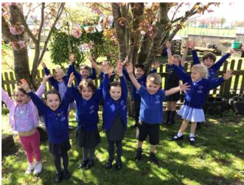
Reception Class enjoying one of our outdoor areas

Serious behavioural problems or incidents will be recorded in the school's discipline/incident book. Hopefully this will never be needed, but in the event that it is, parents will be informed and appropriate action will be taken. Examples would be personal injury, theft, absconding, etc.