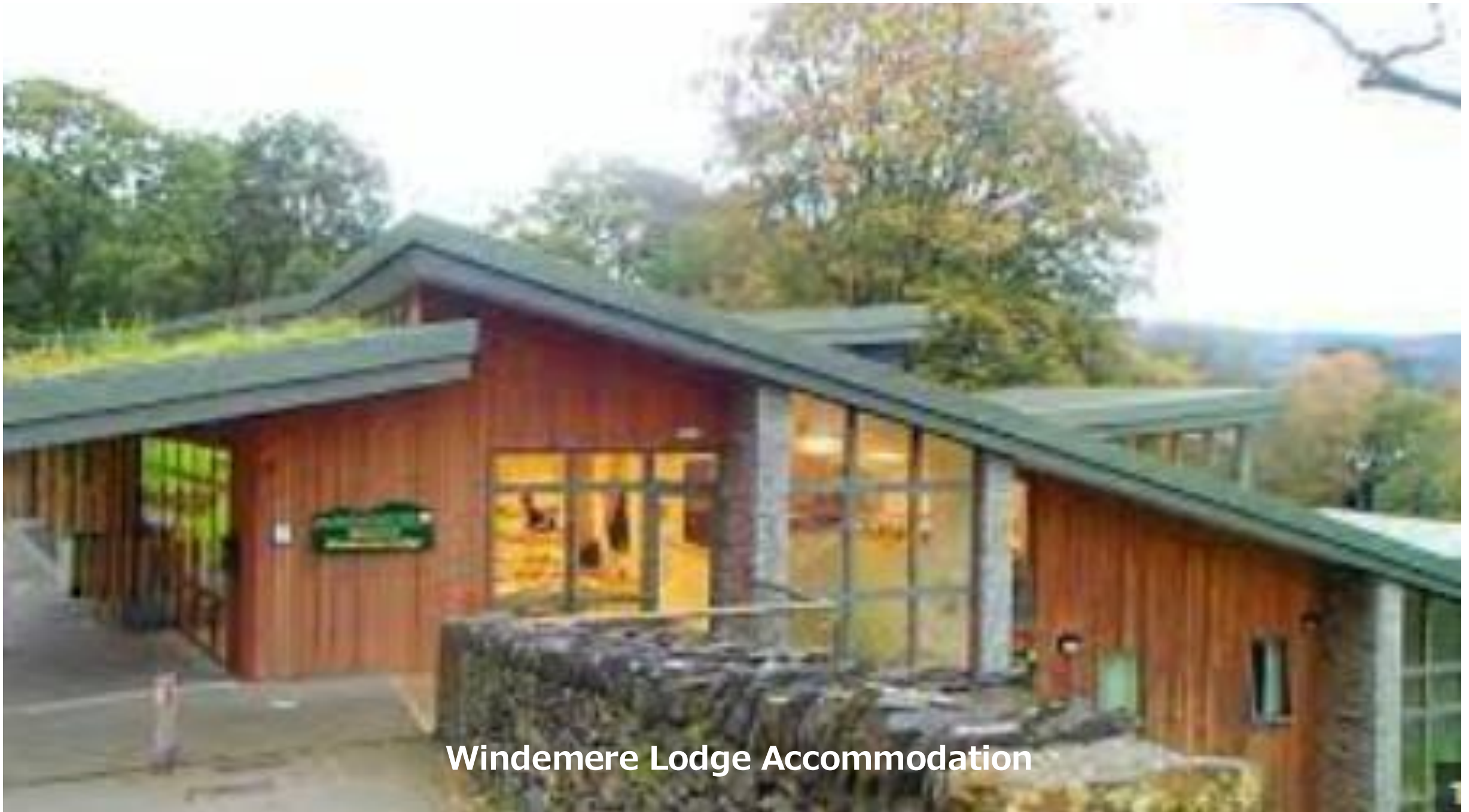
Windemere Lodge Accommodation